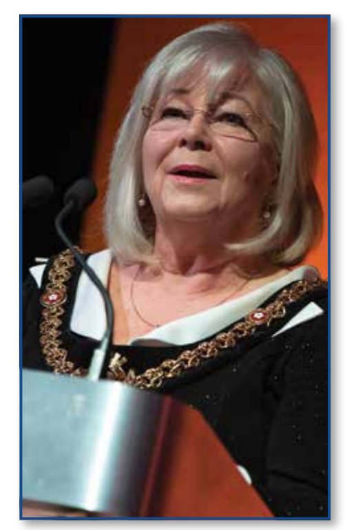
The Rt. Hon. The Lord Mayor of Cardiff, Councillor Dianne Rees